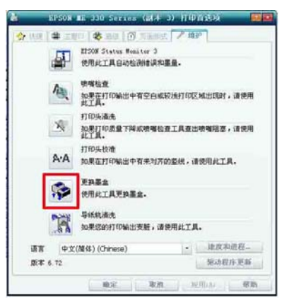
click Maintenance tab to