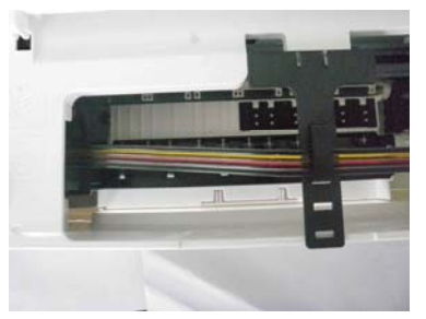
Adjust the tube when cartridge case moves