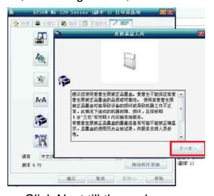
Click Next till the end.