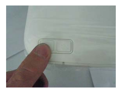
Turn on the printer power switch