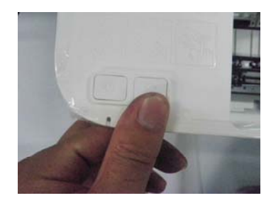
Press the stop button