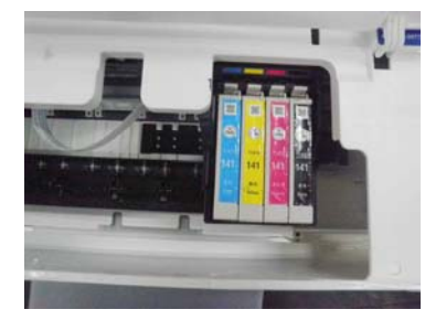
Open cartridge cover