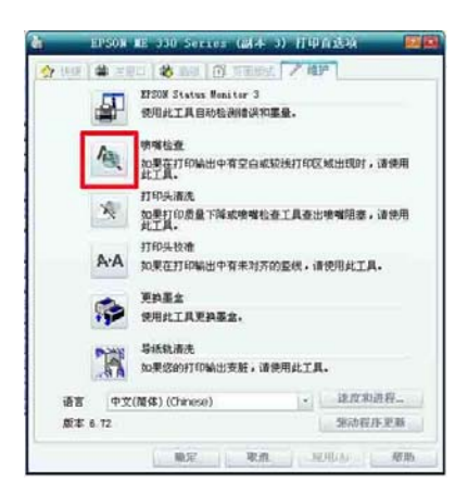
Use Maintenance tools and print out the nozzle checking