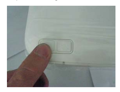
Prepare CISS, then power on