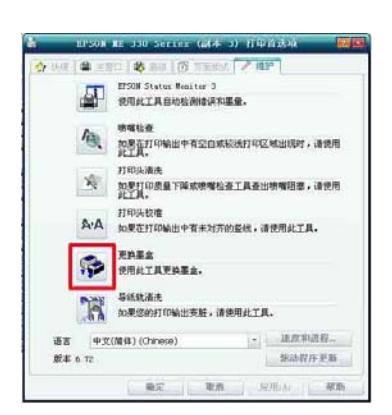
While printing, the printer may shows no ink, the ink light flash, then click on change cartridge item