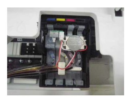
Install CIS cartridges Make sure the cartridges are installed correctly