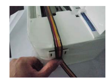
Stick the tube to the right side of printer