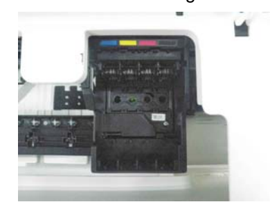
The printer prompts no cartridges, the ink light up.