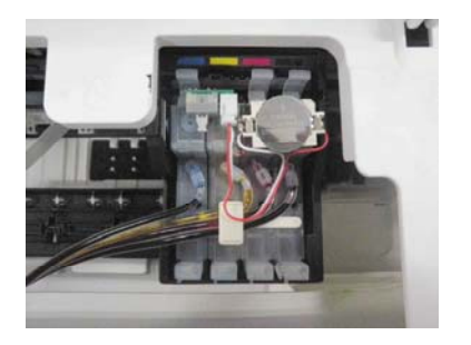
Install the support Arm